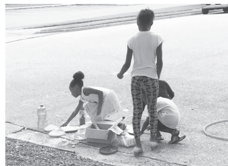
Children preparing bubbles during last years VBS at Courthouse Green.