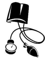
Blood Pressure Checks